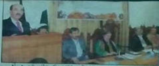
چانسلر ذكي سي فتح محمد برفت عالمي ڪانفرنس تي خطاب ڪري رهيا آهن